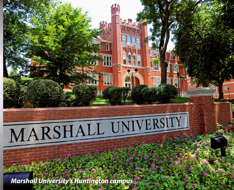
Marshall University's Huntington campus