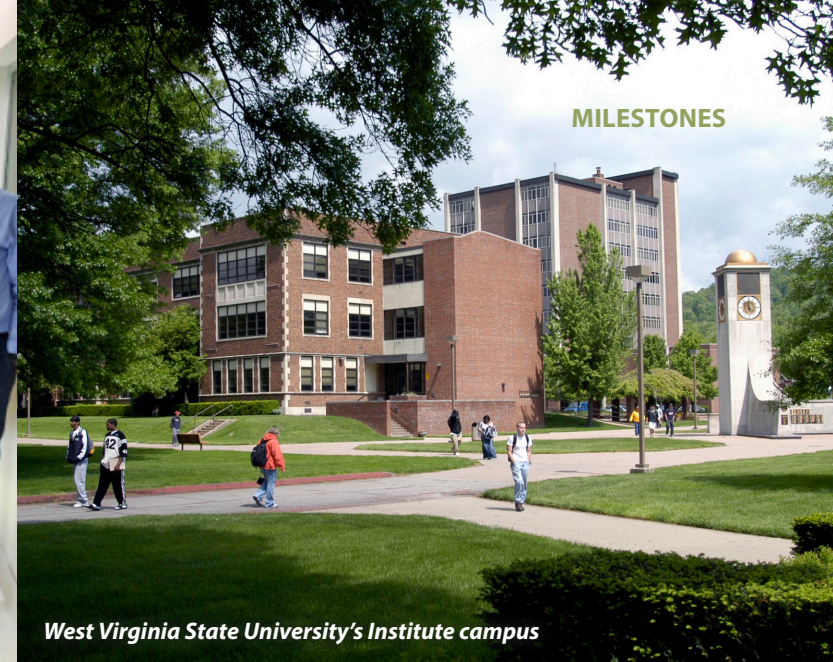
West Virginia State University's Institute campus